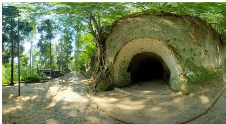
Figure 2. Sunda Ignimbrite at “Gua Jepang”.

20% of the whole volume, the rest of it consist of older material or lithic fragments from country rocks. The deposit thickness is about 33 m on average, covering a 200 km 2 area with a volume of about 66 km 3 . The volume's value is almost the same as the value of the lost material of the Sunda summit part by reconstructing and assuming the summit of Sunda (before caldera-forming) was about 3000 masl.