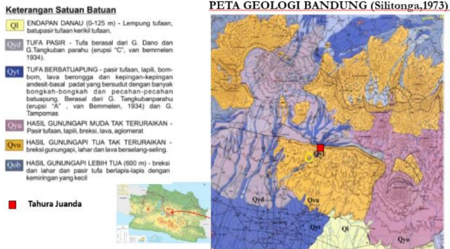
Figure 3. Geological Maps Of Bandung [9].