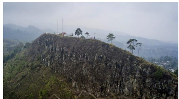
Figure 7. A Fault Scarp at Gunung Batu as a part of the Lembang Fault.

Tangkuban Parahu and Sunda volcanic complex are located close to the intersection between two faults (Fault of Sukabumi–Padalarang and Fault zone of Cilacap–Kuningan) [8]. Lembang fault is a major fault in this area, stretching in an east–west direction. It is an active fault with a distinct northward facing scarp and can be traced along 22 km as a straight line from Mt. Pulusari in the east to the west near Cisarua [1]. The fault scarp of Lembang Fault can be seen at Tebing Keraton and Gunung Batu (Figure 7). The 50 m high Omas Waterfall forming is closely related to the development of Lembang activity. The Lembang fault was classified into a normal fault with the north block moves down and the south block goes up [9].