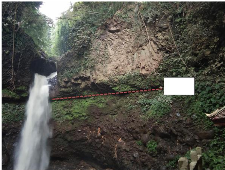
Figure 6. Tangkuban parahu lava covers conglomerate at “Dago Water Fall”. The red dot line is the borderline between the two kinds of rock.