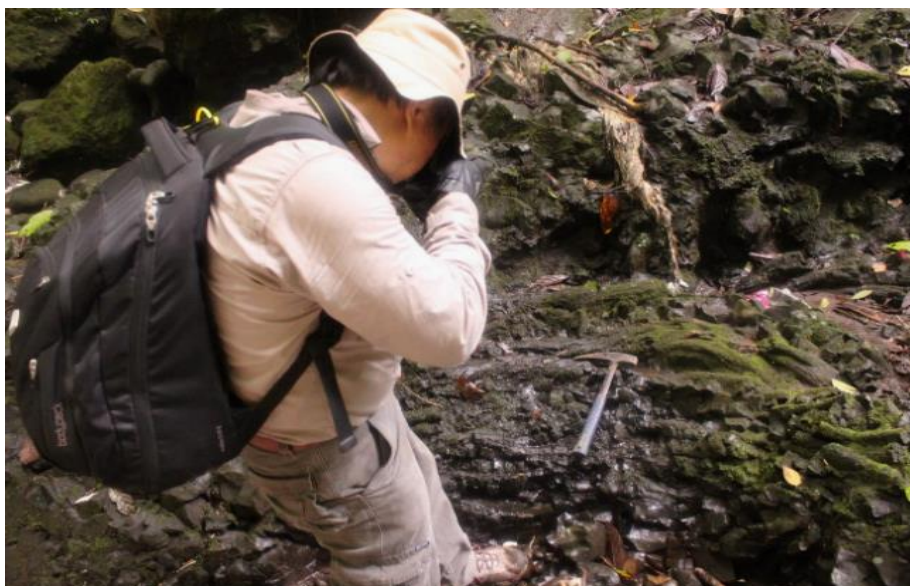
Figure 5. Out crop of ropy lava type at Water fall of Lalay.