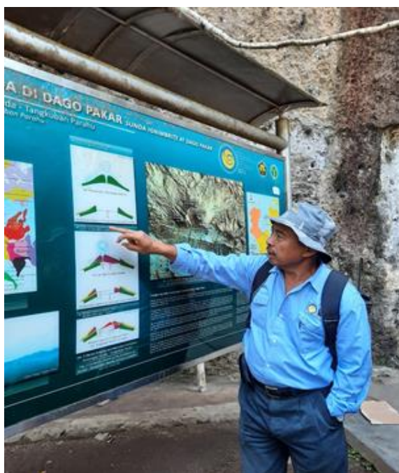
Figure 8. A signboard has been installed at the gate of “Gua Belanda, for geotourism education purpose.