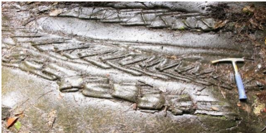
Figure 4. Out crop of Pahoe-hoe Lava type at Cikapundung river bank.